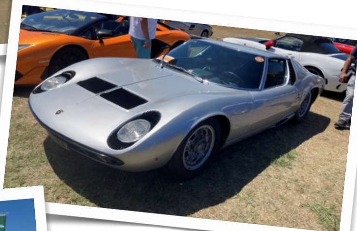
Came across the car of my childhood dreams, 1968 Lamborghini Miura