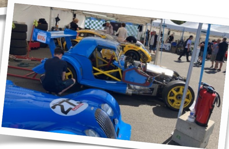
This one is for all you Morgan enthusiasts