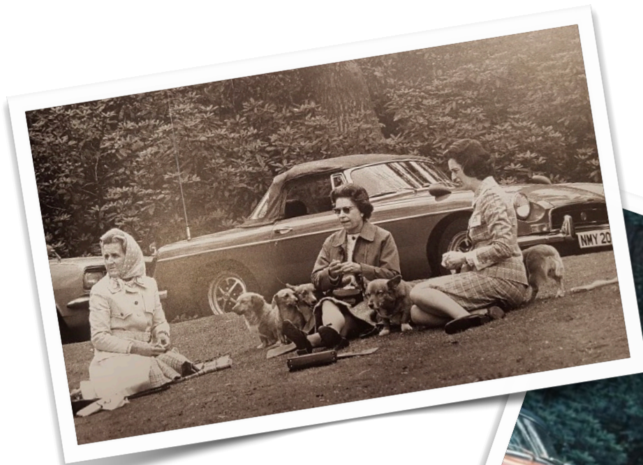
Circa 1973 Windsor Horse Show