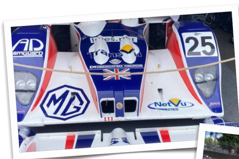
An MG made it to the grid (Lola/ MG Ex257/2001)