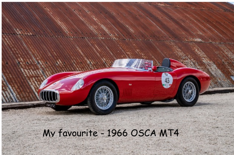
My favourite - 1966 OSCA MT4