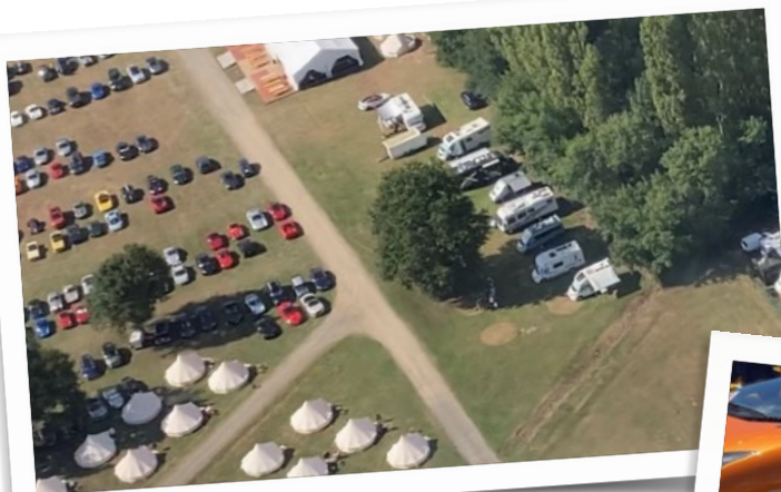
View of our campsite and motorhome from the helicopter (second one in from the bottom)