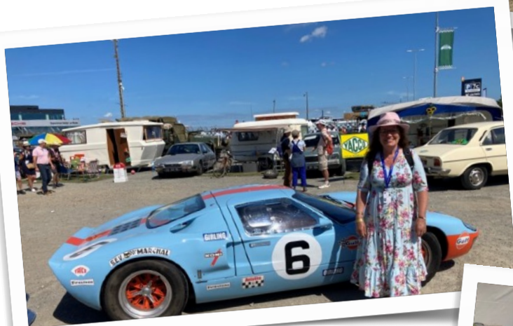
Saw loads of these GT 40s but still my favourite car.