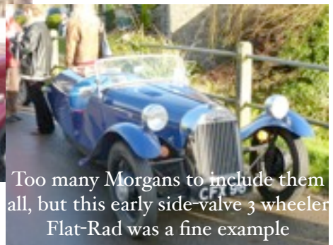
Too many Morgans to include them all, but this early side-valve 3 wheeler Flat-Rad was a fine example