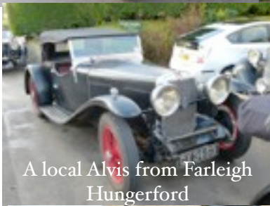
A local Alvis from Farleigh Hungerford