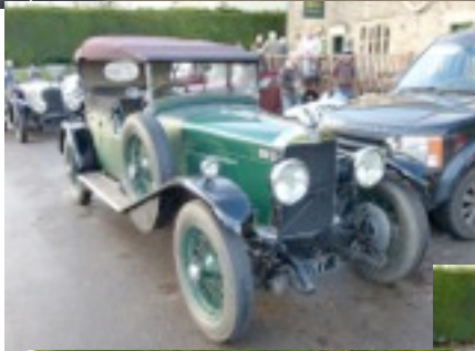
Thankfully not the only "Sunbeam" of the day!!