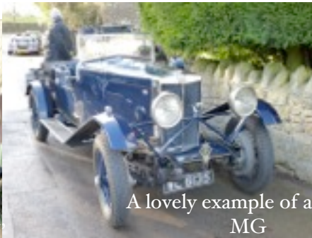
A lovely example of an early MG