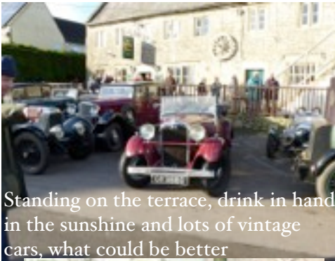
Standing on the terrace, drink in hand in the sunshine and lots of vintage cars, what could be better