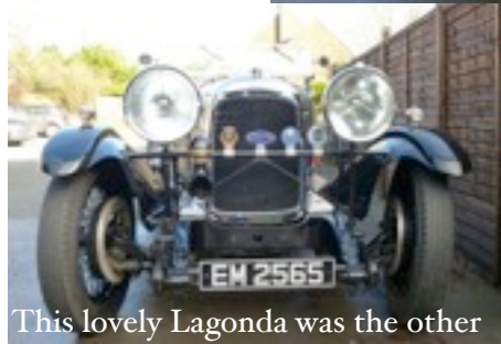
This lovely Lagonda was the other car that I wanted to take home that day