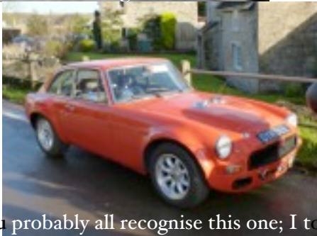
You probably all recognise this one; I took the photo in one of the rare moments when there was no crowds and I was able to close the bonnet!!