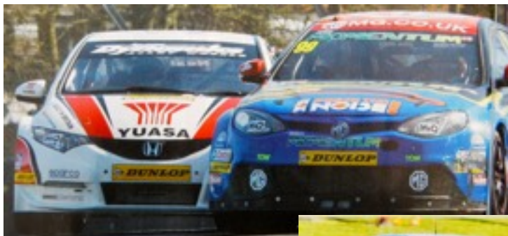
The MG in its blue war paint and at war